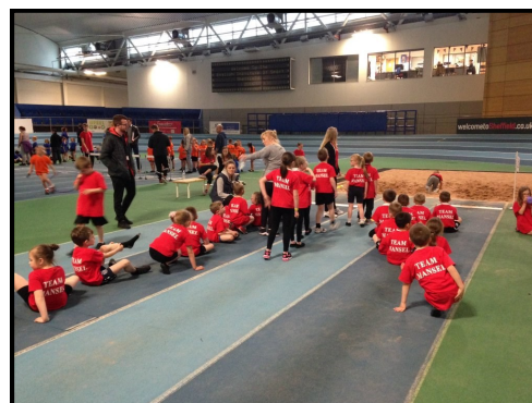
Our Mansel Team at the EIS